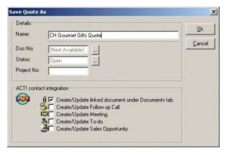
<u>Figure 1</u>: ACT! Integration options available upon saving the quote in QuoteWerks.